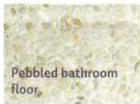
Pebbled bathroom floor