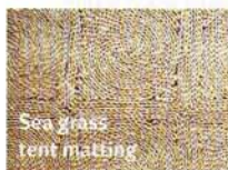
Sea grass tent matting

The beach-inspired look starts with a crisp white background and adds layers of natural materials and textures.