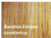
Bamboo kitchen countertop