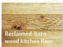
Reclaimed-barn-wood kitchen floor